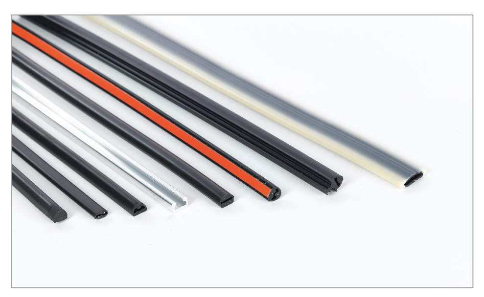
Mayser Miniature safety edges: Small in dimensions - huge in reliability