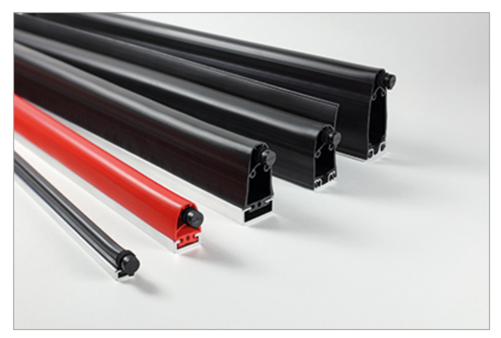
Mayser SP sensor profiles: Large selection of base and profile geometries