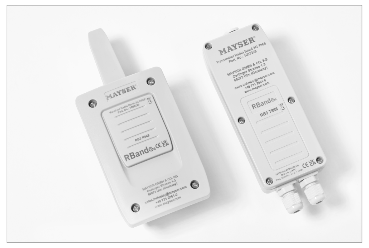
Universal radio transmission system as an ideal complement to Mayser sensor profiles SP