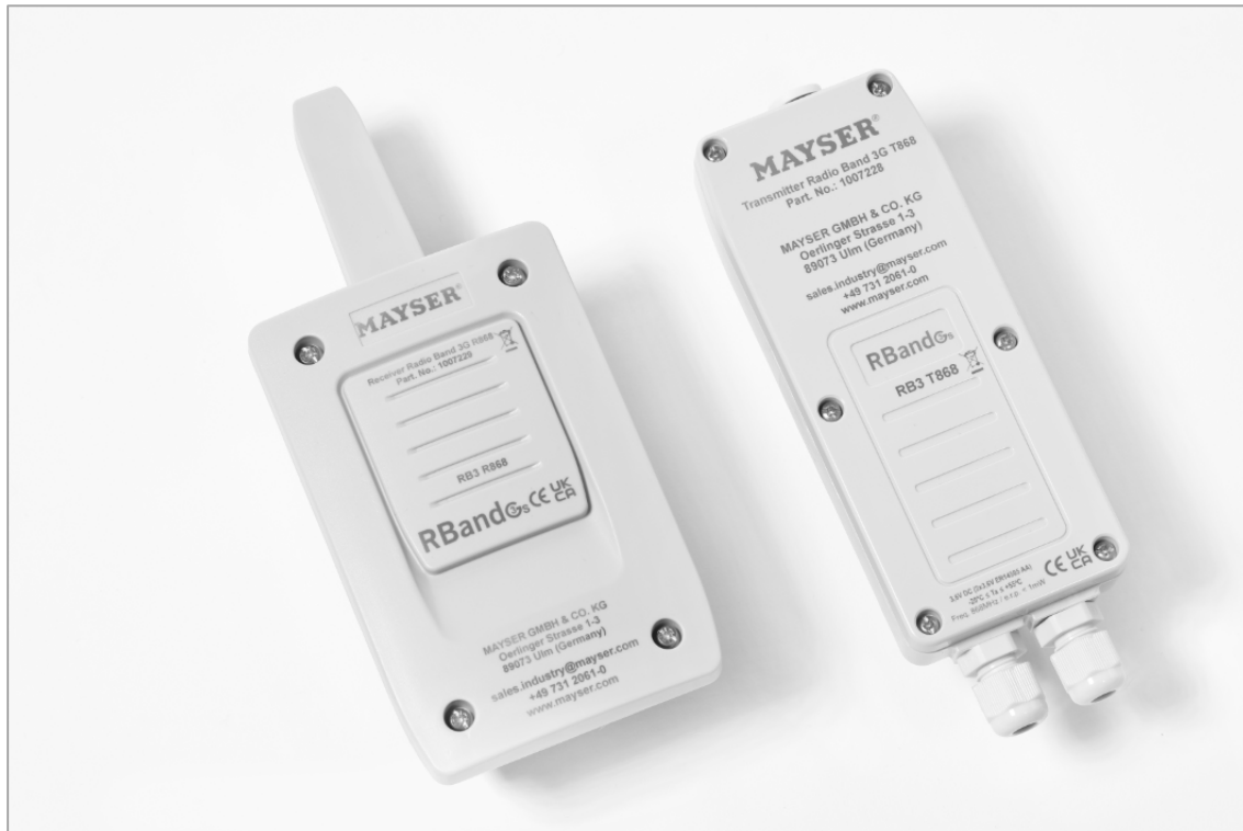
Universal radio transmission system as an ideal complement to Mayser sensor profiles SP